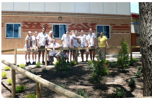
21st Anniversary garden and fascia bricks