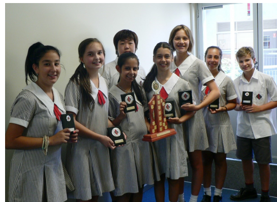
Year 7 debating winners and runner up