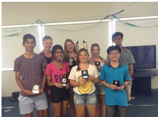
Year 9 debating students