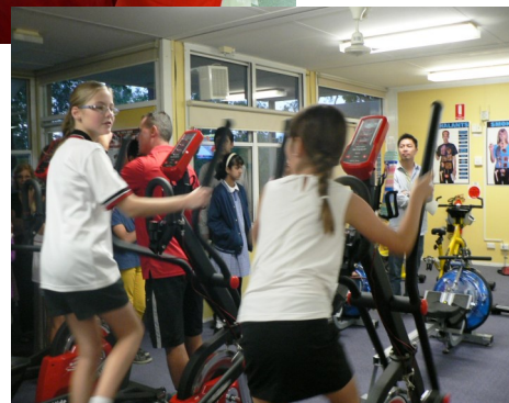
Year 6 into 7 open night