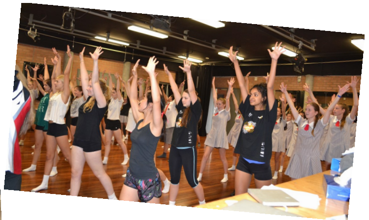
The Wiz rehearsals continue