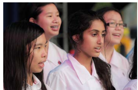
Music Ensembles Perform at the Royal Easter Show