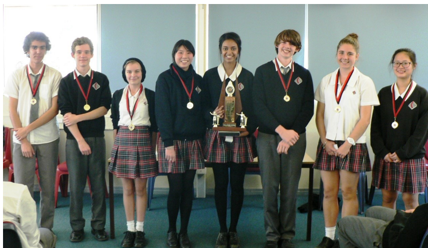
Year 10 Public Speakers

Thank you to the finalists, the class contestants and the teachers who support this initiative that furthers the speaking skills of our next generation of students.