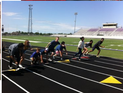
Future Problem Solvers in the US