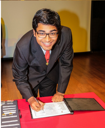
Student Leaders' Induction Assembly