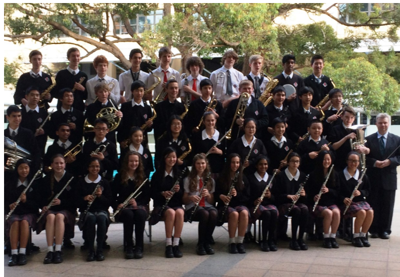
Concert Band 1