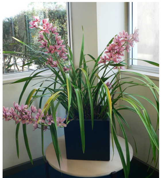
Orchid displays in the front foyer