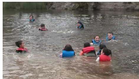
Year 9 Camp