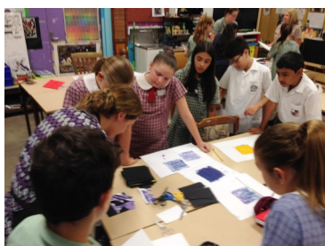
Year 6 into 7 Orientation Day