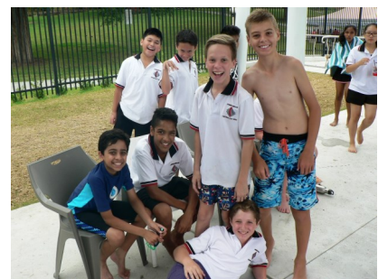
Year 7 Swimming Carnival