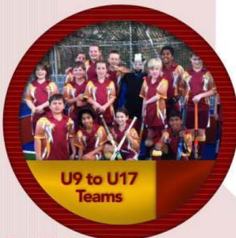
U9 to U17 Teams

Please note Cherrybrook Technology High School does not have any medical practitioners on the premises. We provide first aid assistance to students who are unwell or injured. Please be advised the school does not supply any medication, including pain killers, medicated creams, eye drops etc.