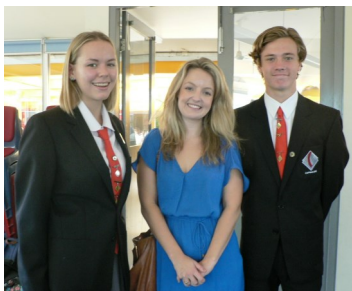
International Women's Day Morning Tea