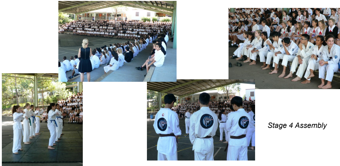
Stage 4 Assembly