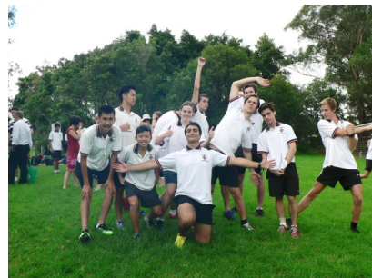
Cross Country Carnival