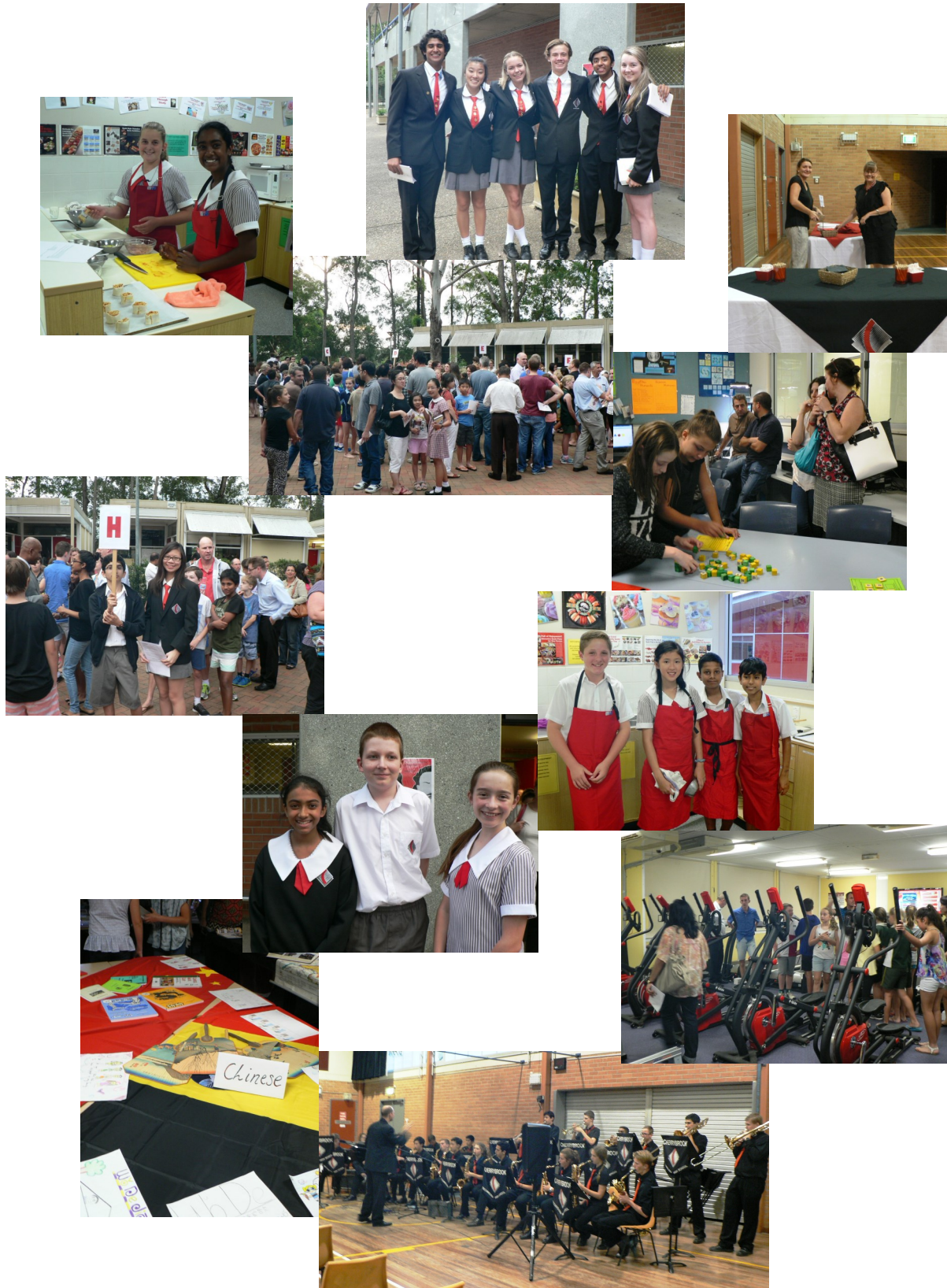
Year 6 into 7 Information Night