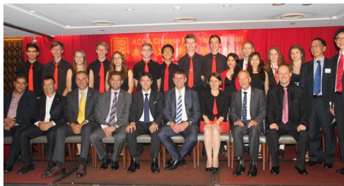
Australian Chinese Association Evening