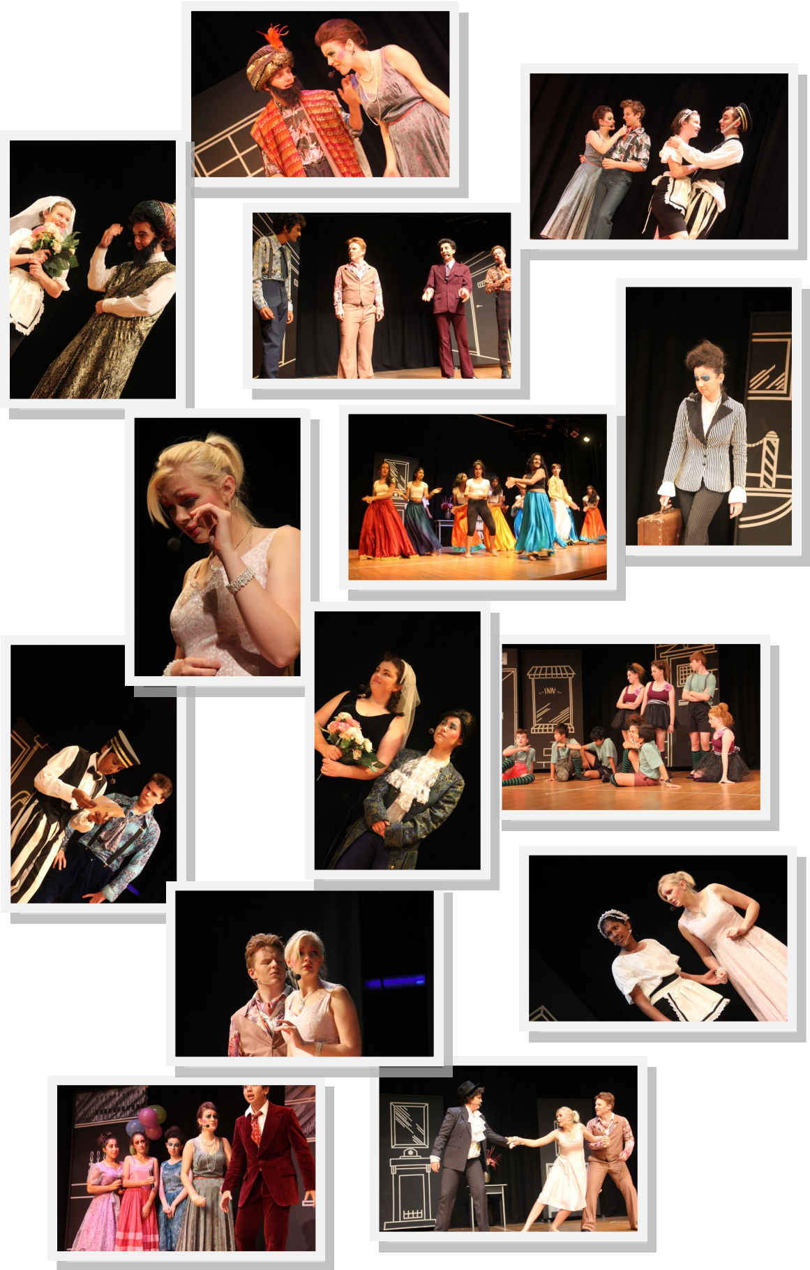
The Servant of Two Masters