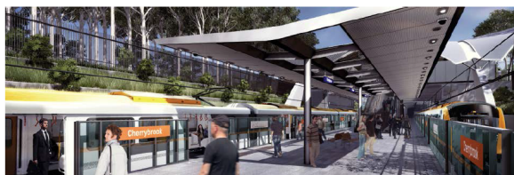
The proposed new Cherrybrook Station