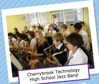
Cherrybrook Technology High School Jazz Band