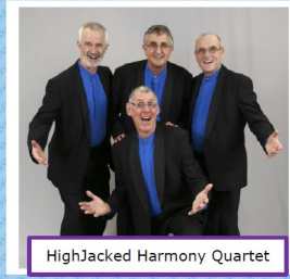
HighJacked Harmony Quartet

Bring your family and friends along and enjoy a fantastic afternoon of entertainment whilst supporting this very worthwhile cause