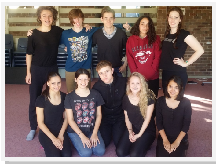
Year 12 Drama Students