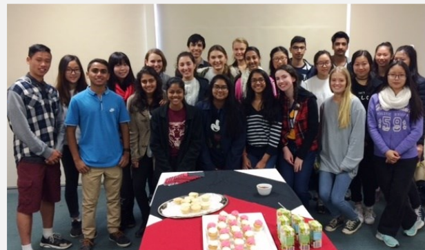
Year 11 High Achievers on Mufti Day