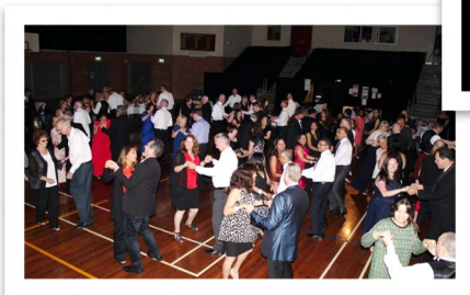
CTHS Moondance Ball