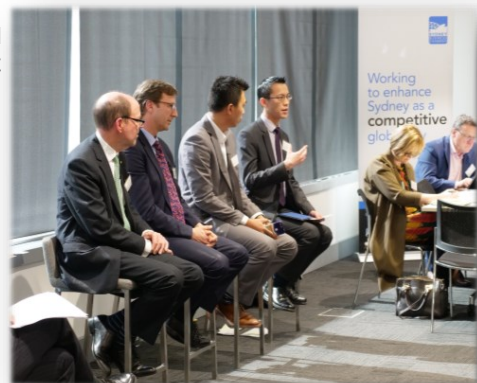
The NSW Business Chamber Forum

The day proved to be tremendously interesting with many ideas, some possible, others less so, but nevertheless well worth considering. Once the data from the day is collated into a manageable format I look forward to sharing it with you.