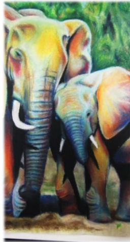
By Amy Hill