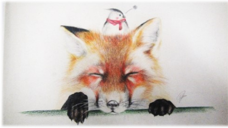
By Yvonne Huang