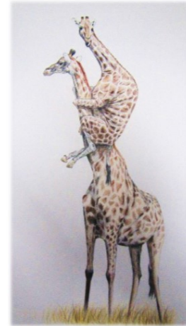
By Jade Hsu