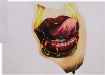
Alicia Spencer - Temptation