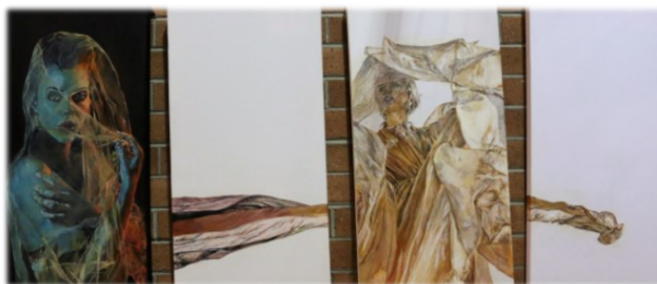
Dinuki Perera - Allure