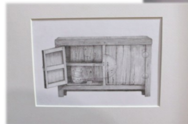
Helene Qu - Les Aventures d'Eloi