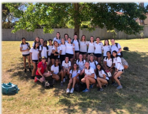
Girls' Speedway A team