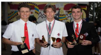
Softball Team of the Year