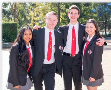
2020-2021 School Captains & Vice Captains